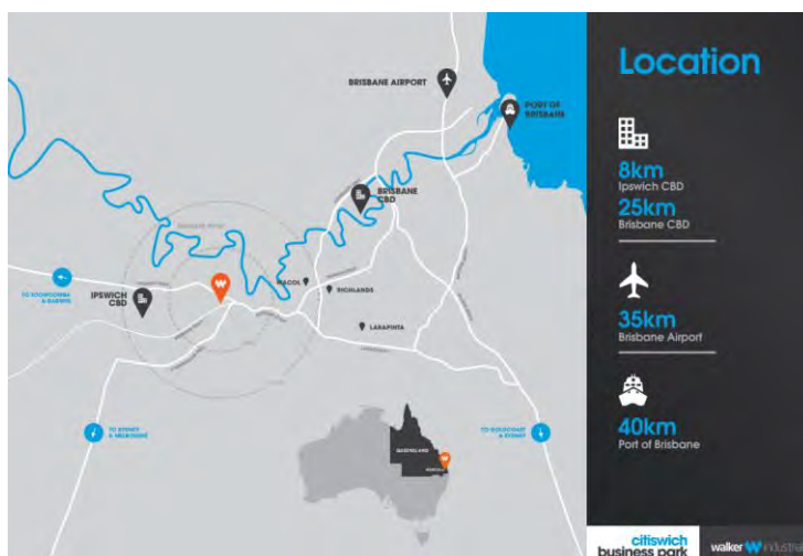
Figure 1 Location of Citiswich

Walker Corporation's Citiswich is Queensland's largest industrial development, providing affordable, well-connected industrial land for a broad range of businesses. Notably, five billion dollars of transport and service upgrades to the region have brought Citiswich to life, facilitating reduced travel times to key hubs and centres including airport, Brisbane port and CBD.